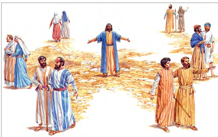
Jesus summoned the Twelve and began to send them out two by two.

I think of the founder of my Order, St. Peter Julian Eymard, when I read this passage. In the many letters he wrote, he can be heard instructing his colleagues along a broad spiritual path. His ministry involved prayer before the Blessed Sacrament, and reaching out to people who were in need, both physically and spiritually. In a spiritually starved France he prepared many